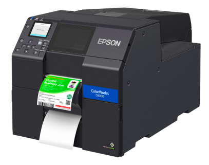
CW-C6000P 4" Peel-and-present

Epson offers the first color inkjet printer with peel-and-present capability, which can help speed up the manual application of on-demand labels. An integrated label-taking sensor holds off subsequent printing until the previous label is removed. This feature is ideally suited for fully automated label application systems. This unique capability eliminates the need for a loose loop and allows individual labels to be taken as soon as they are printed.